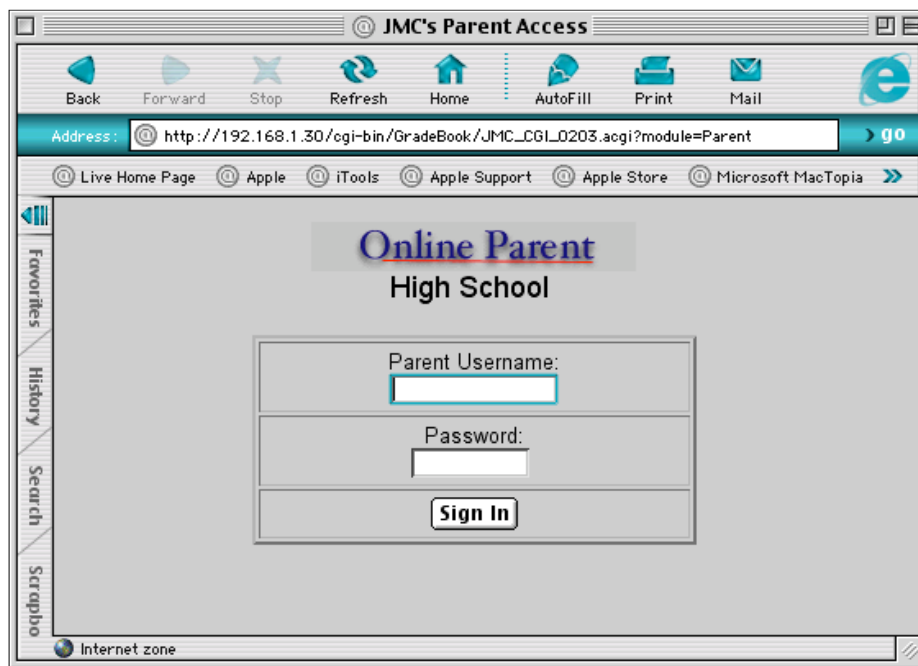
Figure 1: Parent Access login screen.

Note: For security purposes, the characters you type as you enter your